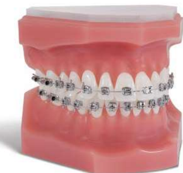
Pinnacle Ideal Occlusion Typodont Item #: G50-360